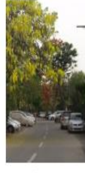
AMALTAS TREE LINED STREETS

Providers of Oxygen, Food [They provide fruits and nuts for humans and wildlife. Flowers contain nectar for bees, butterflies and other insects], Shade, Wood and waste for composting.