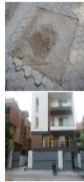
TOP: Tree removed and not replaced BOTTOM: VV loses street trees to builder houses.