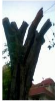
A badly lopped Peepal tree.