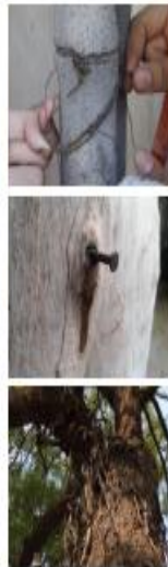
TOP & BOTTOM: Wires strangling trees. MIDDLE: Nails make trees cry.

INTRUSIONS: NAILS, TREE GUARDS, WIRES, CABLES