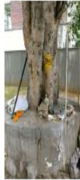
Chabutra around a tree confine expansion and make it impossible for water to percolate