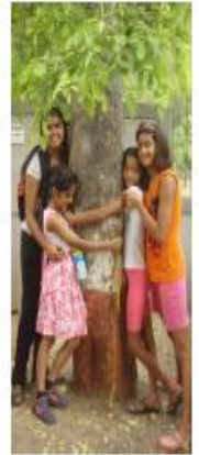
Trisha, Bani, Sanvi and Smara hugging a tree.

Trees support biodiversity and wildlife. An increase in tree diversity will benefit a host of insects, birds and mammals in our towns and cities.