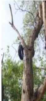
Dead tree- needs replacing.