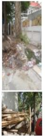
TOP: Pollution around the tree- the tree cannot digest it all. BOTTOM: Tree bending from pressures of construction