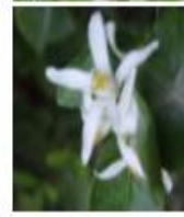
A lady bug

Trees support biodiversity and wildlife. An increase in tree diversity will benefit a host of insects, birds and mammals in our towns and cities.