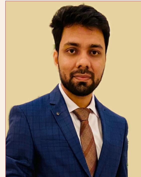
CO-FOUNDER · MENTBLUE