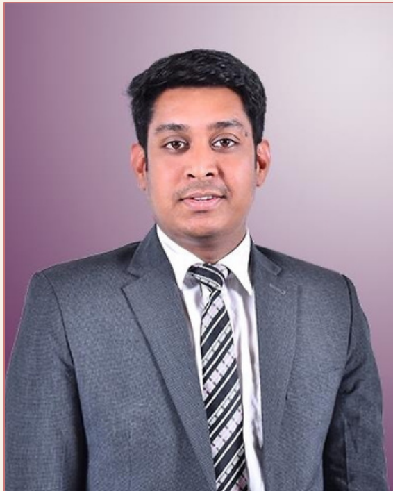
CO-FOUNDER · MENTBLUE

Day-to-day delivery of the programme - admissions, faculty coordination, participant support - is led by the Mentblue team.