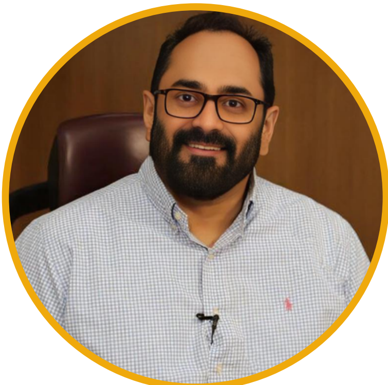
HONBLE SHRI RAJEEV CHANDRASEKHAR

HON'BLE UNION MINISTER OF STATE (I/C) FOR LAW & JUSTICE, PARLIAMENTARY AFFAIRS AND CULTURE, GOVT. OF INDIA