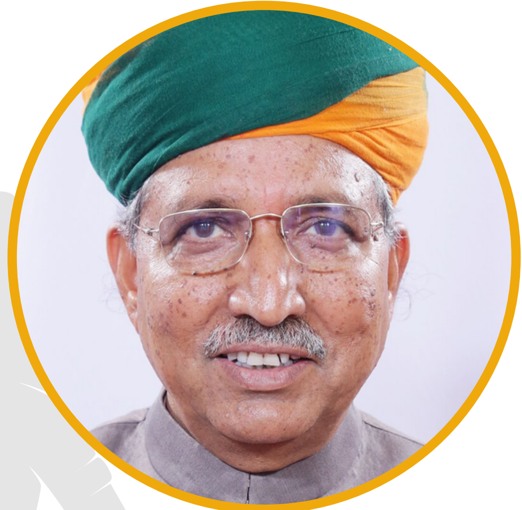
HON'BLE SHRI ARJUN RAM MEGHWAL

HON'BLE GOVERNOR OF HARYANA & CHANCELLOR, DR. B.R. AMBEDKAR NATIONAL LAW UNIVERSITY, SONEPAT