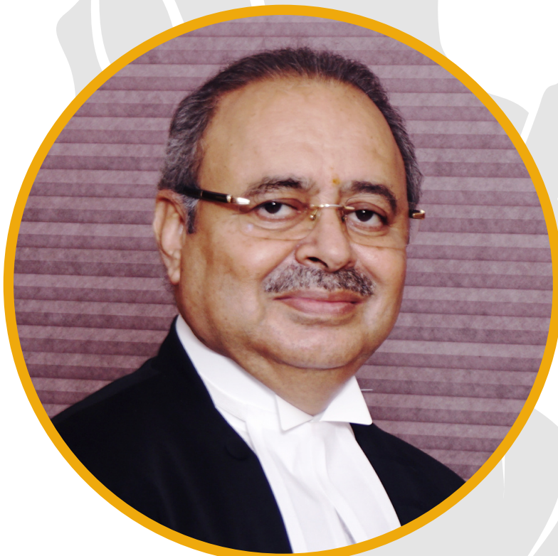
HON'BLE MR. JUSTICE RITU RAJ AWASTHI

HON'BLE UNION MINISTER OF STATE FOR ELECTRONICS AND INFORMATION TECHNOLOGY & UNION MINISTER OF STATE FOR SKILL DEVELOPMENT AND ENTREPRENEURSHIP, GOVT. OF INDIA