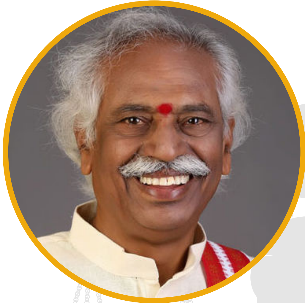
HON'BLE SHRI BANDARU DATTATRAYA

HON'BLE GOVERNOR OF HARYANA & CHANCELLOR, DR. B.R. AMBEDKAR NATIONAL LAW UNIVERSITY, SONEPAT