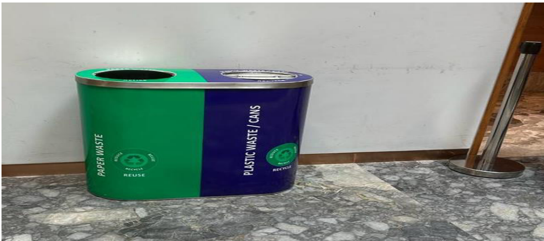
Figure I – Separate Plastic & Paper waste Bins

36. The importance and general public requirement of plastic waste management becomes evident from the fact that at all public places, in present times, dust bins have been provided where plastic waste is to be disposed of in separate bins especially specifically dedicated for plastic waste, whereas other waste is to be disposed of in separate bins. The below reproduced figures depict such separate waste bins at airports / railway stations / bus terminals/multiplexes / malls etc., and even in public parks.