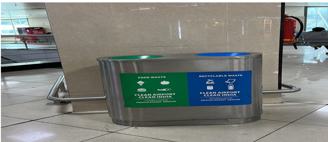
Figure 2 – Separate Waste Bins at Airports for Solid Waste and Recyclable Waste (Plastic Waste)