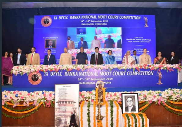
9th FYLC RANKA MOOT COURT