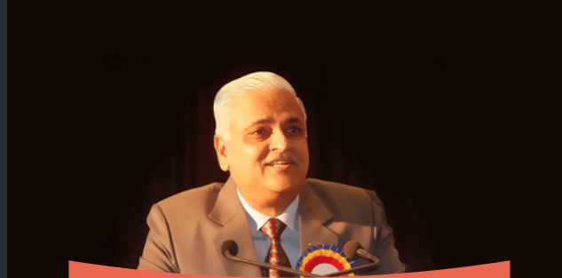
Hon'ble Mr. Justice Anil R. Dave Former Judge of Supreme Court of India