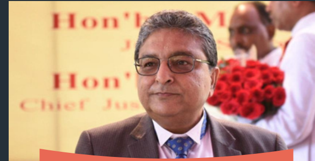
Hon'ble Mr. Justice Vineet Saran Former Judge, Supreme Court of India Chief Guest, 10th Fylc Ranka Moot Court