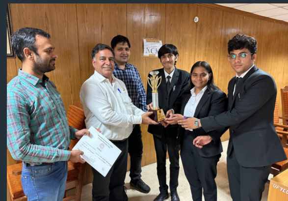
UFYLC ICMCC, 2023