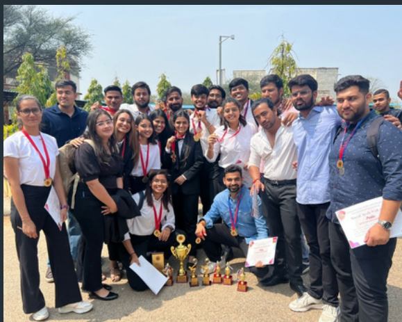
INTRA COLLEGE SPORTS MEET