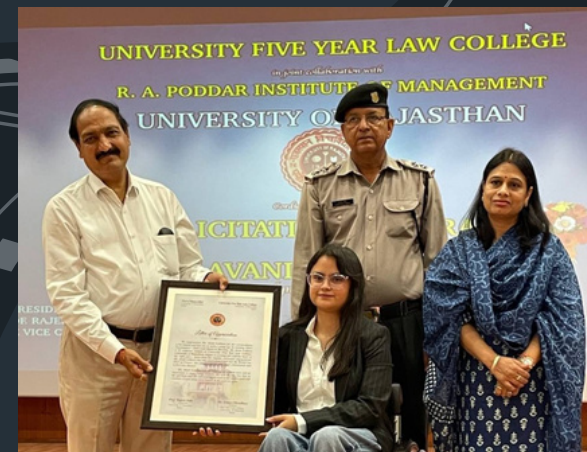
Avani Lekhara FELICITATION PROGRAM