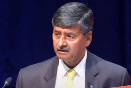
Hon'ble Justice Mr. Ajay Rastogi Judge Supreme Court of India Former Chief Justice; Tripura & Rajasthan High Court Guest, 9th Fylc Ranka Moot Court