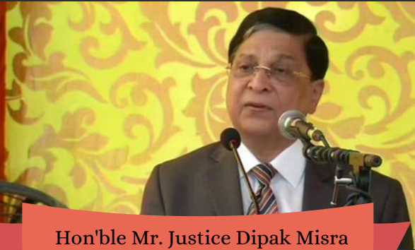
Hon'ble Mr. Justice Dipak Misra Former Chief Justice of India