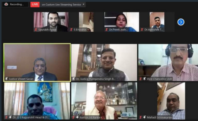
10th FYLC RANKA MOOT COURT- ONLINE