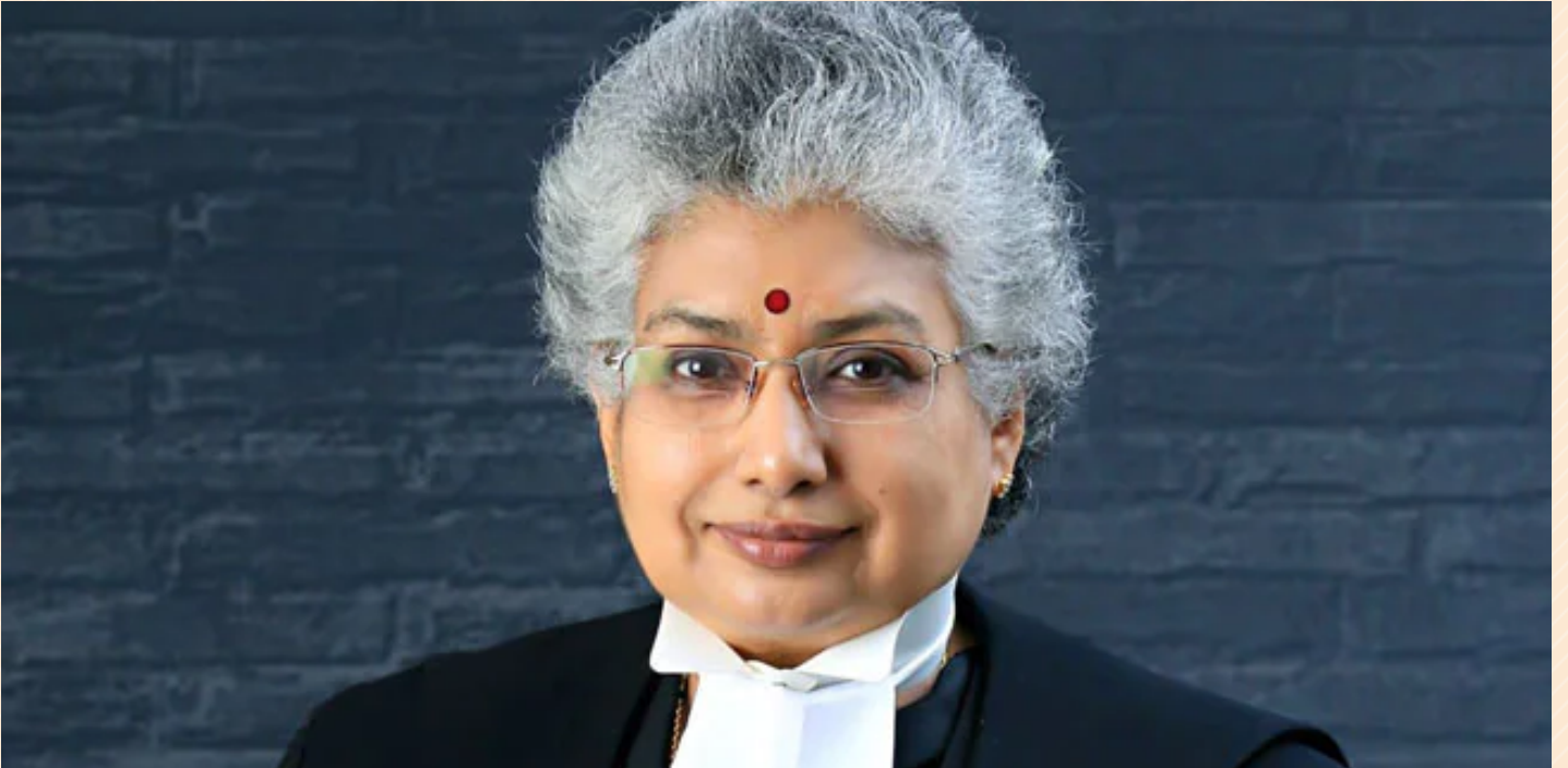
Hon'ble Mrs. Justice B.V. Nagarathna Judge, Supreme Court of India

Justice Bangalore Venkataramiah Nagarathna, born on October 30, 1962, in Bengaluru, is a distinguished judge of the Supreme Court of India. She also served as Amicus Curiae in significant cases, showcasing her commitment to justice. Elevated as an Additional Judge of the Karnataka High Court in 2008, her lordship's tenure witnessed remarkable contributions, including her role as President of the Karnataka Judicial Academy and Bangalore Mediation Centre.